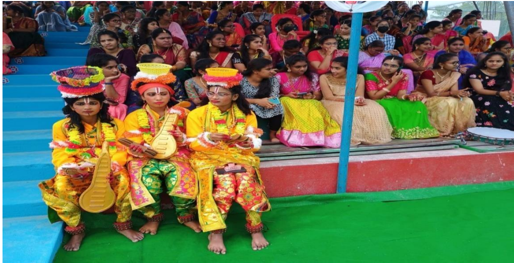
When we think of Sankranthi Festival, the pious souls that come to mind are Haridasulu. Our B Tech students enacted as Haridasulu, who spread the spiritual values of India.