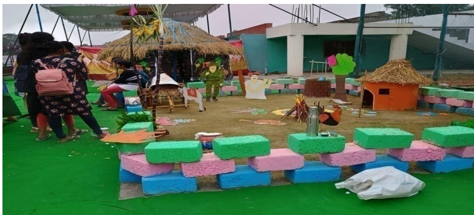
The roots of the great Indian culture lie in villages. Here is a replica of a village that reflects our professions, culture and the spirit of India. It was designed and built up with the assistance of our ART & Craft Club members.