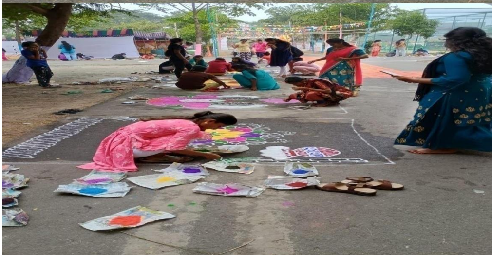
Art, culture and science are blended and tradition adapted, it competed and won Cultural Fest 'Sankranthi Sambarulu