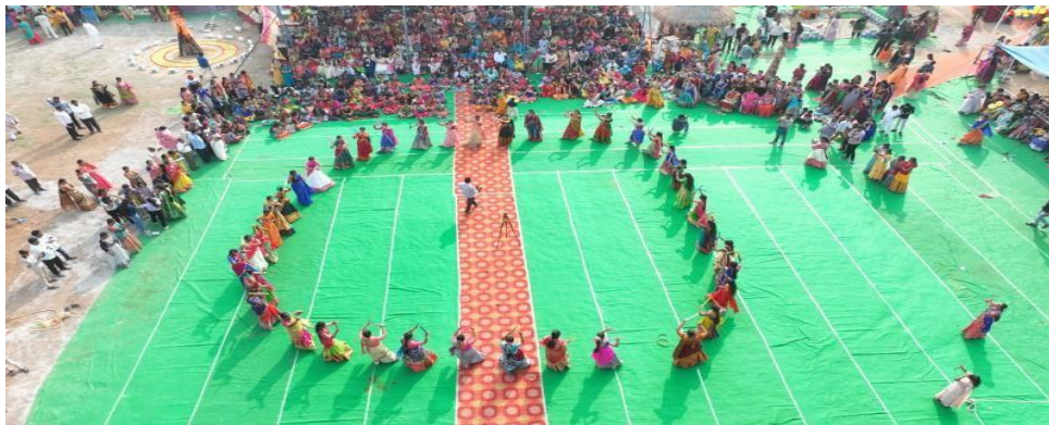
Focus on study as well as on cultural aspects is the strength of our students. Our CSE students' rhythmic performance in Kolatam stole the heart of everyone.