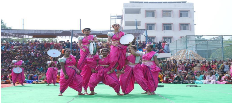
Our Students from AL&D and AI&ML at their high spirit performing a dance on the hilarious cultural fest Sankranti Sambaralu