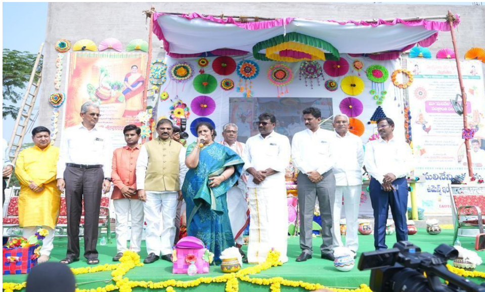
OurchiefGuestSmtPurandhareswari,StatePresidentofBJP.addressingour childrenonthespectacularculturalevent'Sankranthi Sambaralu